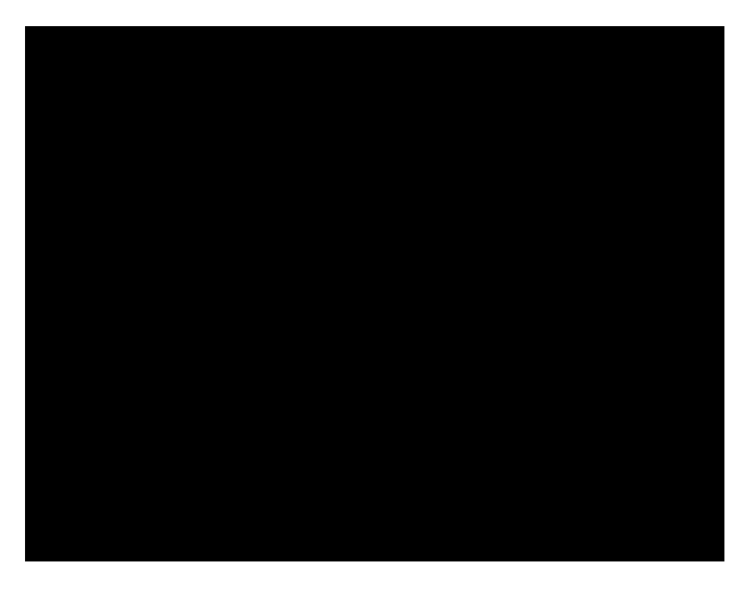
Fig. 3: Example of firewall deployment

sliced into a minimum overlap in RPAs as Eq. (3) describes. However, since RPAs are created by two rule sets, R_{in} and W_{out} , RPAs for F_{z_i} have two domain bitmaps in each